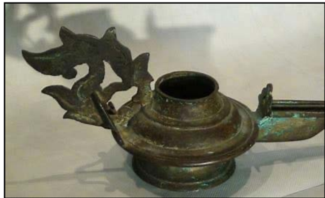
Ancient Chinese Oil Lamp

We face many obstacles: political tensions between the U.S. and China, a global pandemic, and restrictive policies toward religious and foreign nonprofit organizations.