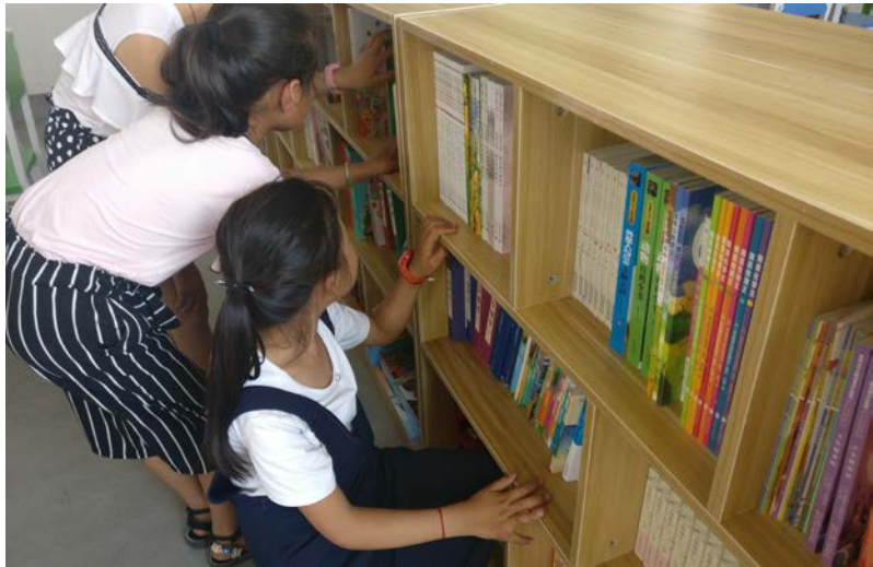
Our Library Project for Zhoufan Primary School

From a government approved list, we coordinate with local primary school principals and education boards to purchase multiple copies of a selection of math, science, geology, cultural and ancient Chinese literature books. We purchase shelving, tables, chairs, lamp fixtures, and decorative items. The schools partner to provide the building space and electricity. They provide all the manual labor. The Chinese educators prohibit placement of any religious or western literature. We politely decline to purchase any books related to communist ideology or revolutionary history.